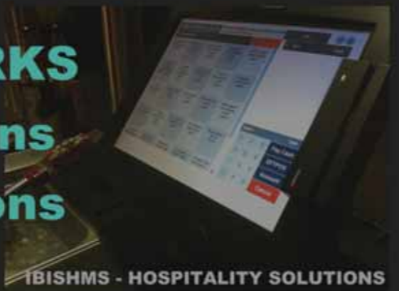
IBISHMS - HOSPITALITY SOLUTIONS

VOICE - DATA - NETWORKS BUSINESS CRM Solutions POS & Ticketing Solutions